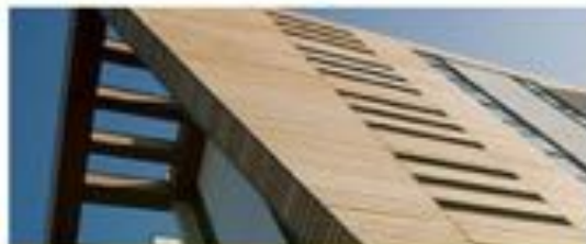
Legal & UK Govt Requirements