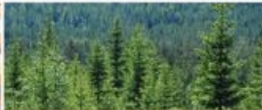
Forest Legality & Sustainability