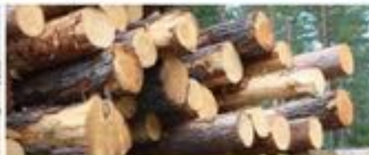
Specifying Sustainable Timber